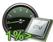
Low CPU Cost, Fast Speed, High Quality