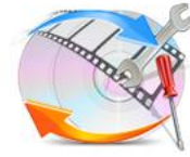
Flexible DVD Title/Chapter Copy