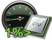
Low CPU Cost, Fast Speed, High Quality