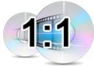
Full DVD Copy with 1:1 Ratio