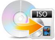
DVD Burner & ISO Mounter