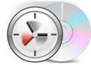
Repair Corrupted/ARccOS Bad Sectors