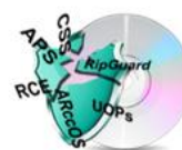
Constantly Support Latest DVD Protections