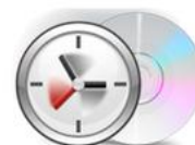
Repair Corrupted/ARccOS Bad Sectors