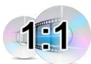
Full DVD Copy with 1:1 Ratio

DVD-Cloner 2019 Crack is a widely-acclaimed professional DVD copy software with perfect output image quality, which can decrypt and copy a DVD to any .... DVD Cloner 2015 is the best DVD backup software. It is supports ... You can easily download DVD Cloner free with crack also free. ... Avast Internet security 2016 With License key 2015 to 2017 Avast Internet security 2016 With License .... Dear Internet Archive Supporter,. I ask only once a year: please help the Internet Archive today. Right now, we have a 2-to-1 Matching Gift .... DVD Cloner 2020 Crack is quite intriguing and crucial applications right now of ... DVD Cloner 2017 Crack + Lifetime Activation Key, DVD Cloner 2017 Crack + ... Edelstenen met onze Castle Clash Hack