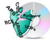
Constantly Support Latest DVD Protections