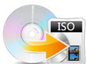
DVD Burner & ISO Mounter